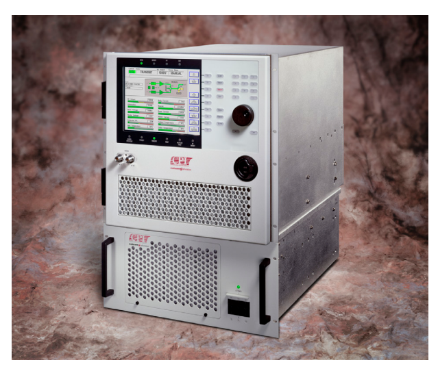
CPI 500 W M-band TWTA, Model VZSC2780C2

Backed by over 40 years of satellite communications experience, and CPI's worldwide 24-hour customer support network that includes more than 20 regional factory service centers.