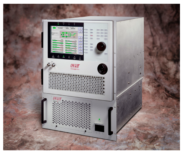
CPI 500 W M-band TWTA, Model VZM2780C2

Backed by over 40 years of satellite communications experience, and CPI's worldwide 24-hour customer support network that includes more than 20 regional factory service centers.