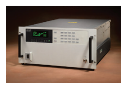
Model VZS/C-6963J2 250 watt and 320 W S/C-band TWTA for EMC/EMI Test Applications

Modular design and built-in fault diagnostic capability, backed by CPI's worldwide 24-hour customer support network that includes more than twenty regional factory service centers.