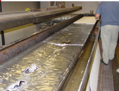
Minimal Damage after Fire Test