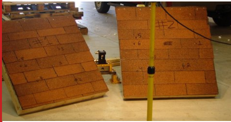
Hail Damage Test