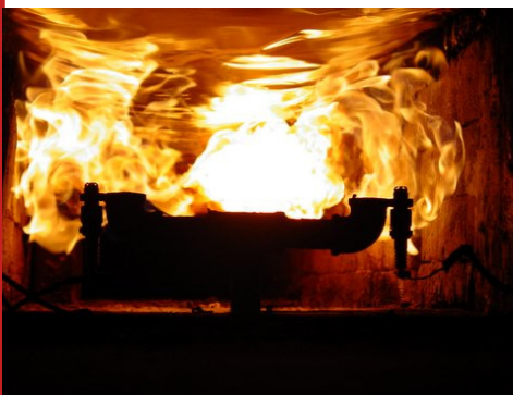
Fire Test Tunnel 1860°F