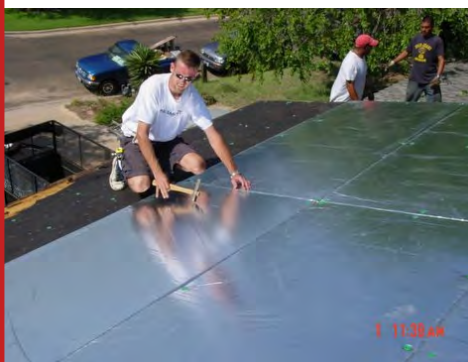
Roof Installation Provides Significant Shielding