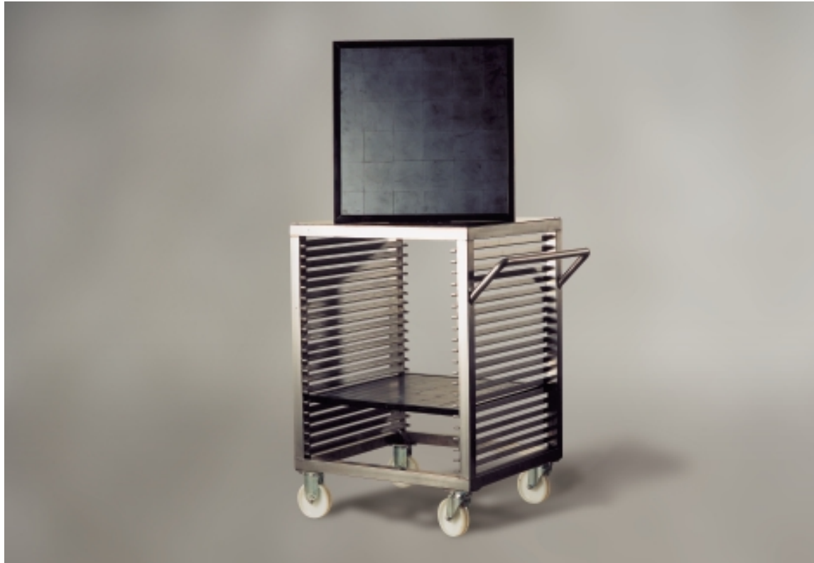
FP-2 ferrite tile floor plate and TP-21 trolley